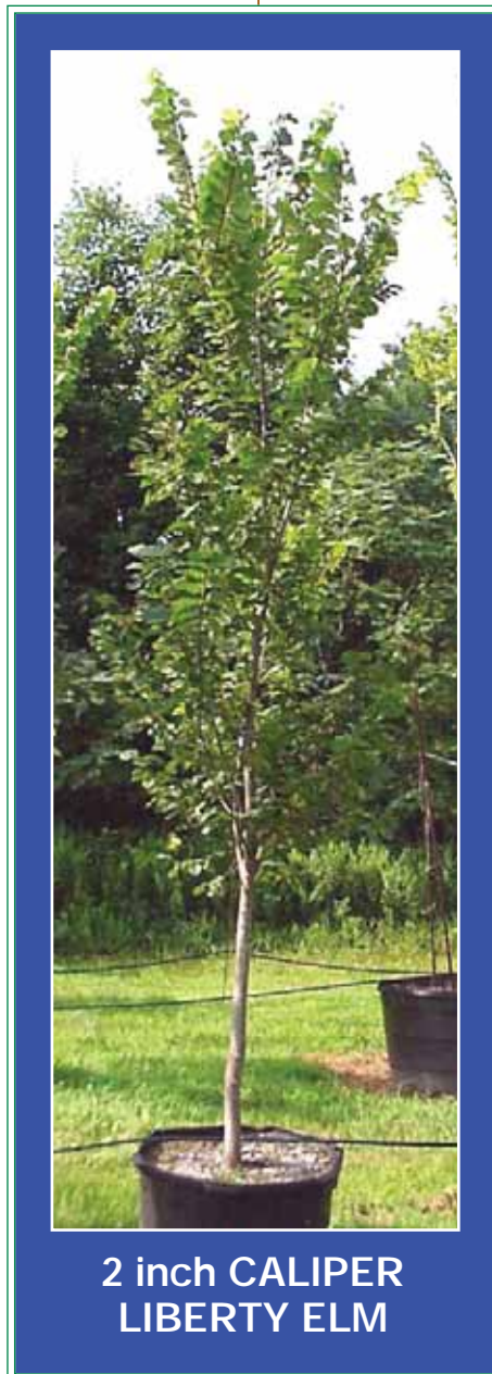
2 inch CALIPER LIBERTY ELM

Please visit our website at www.better-than-flowers.com to order a tree, gift certificate, or personalized bronze plaque - with your words - in time for your special date. Memberships start at $100.